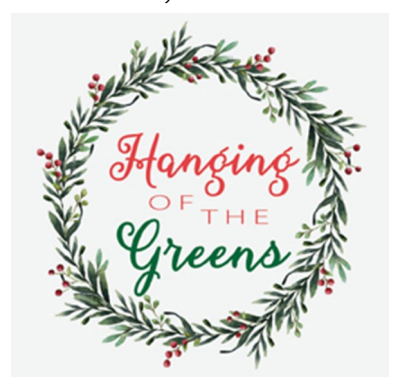
Morning Worship at 10 AM Churchwide Lunch after Worship