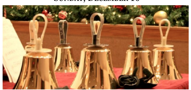
Christmas Worship with the Handbell Choir