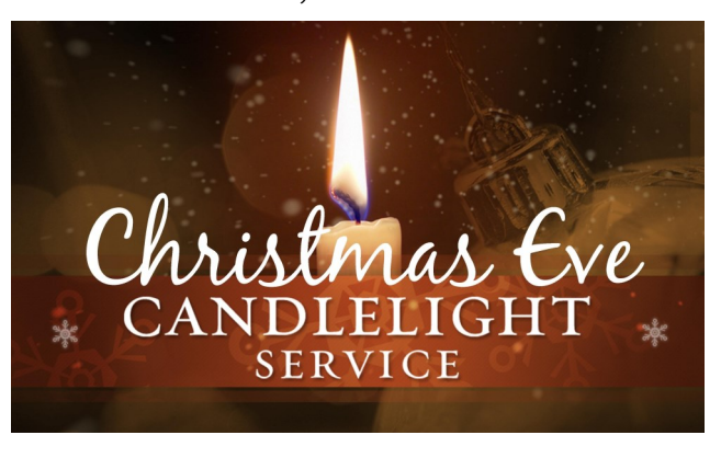
Morning Worship 10 AM (No Sunday School) Candlelight Service 6 PM